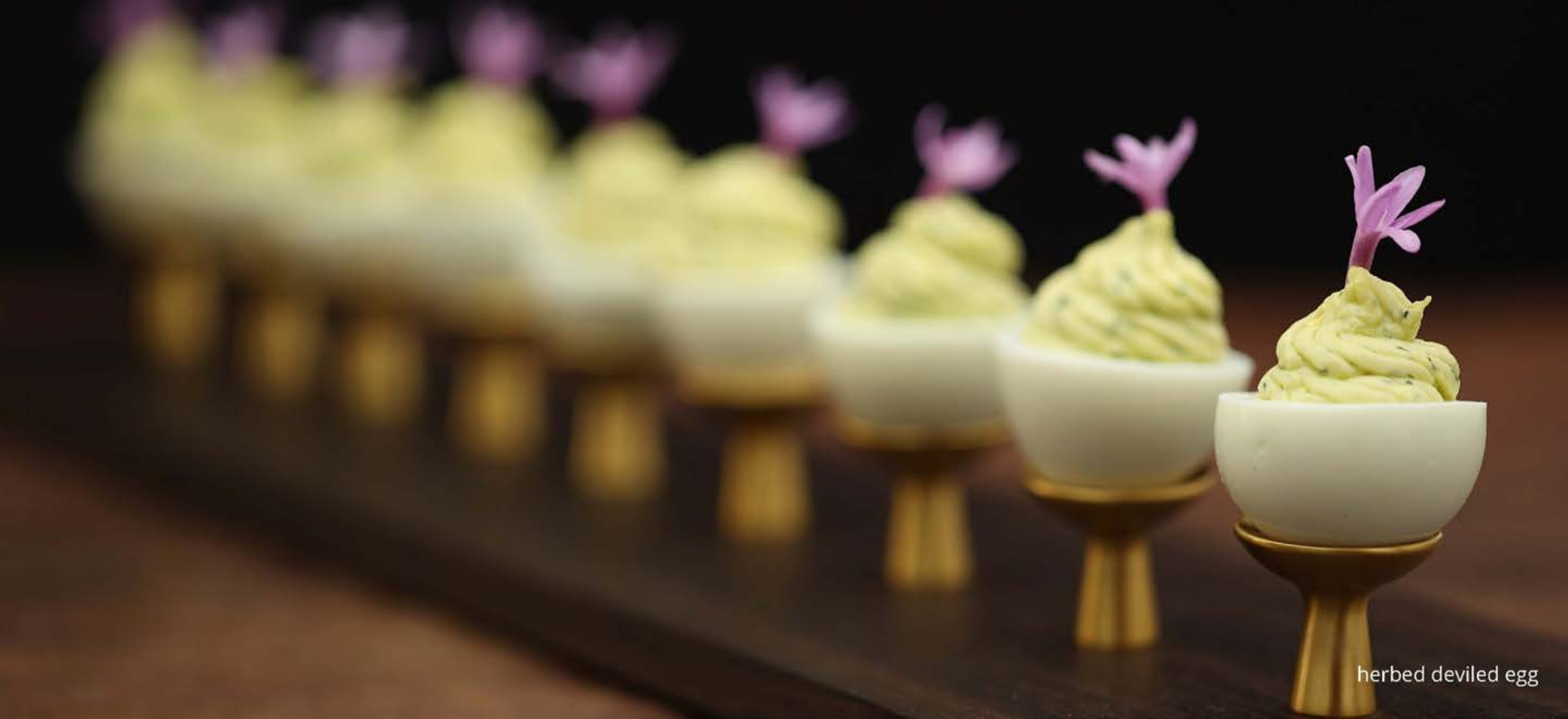
herbed deviled egg