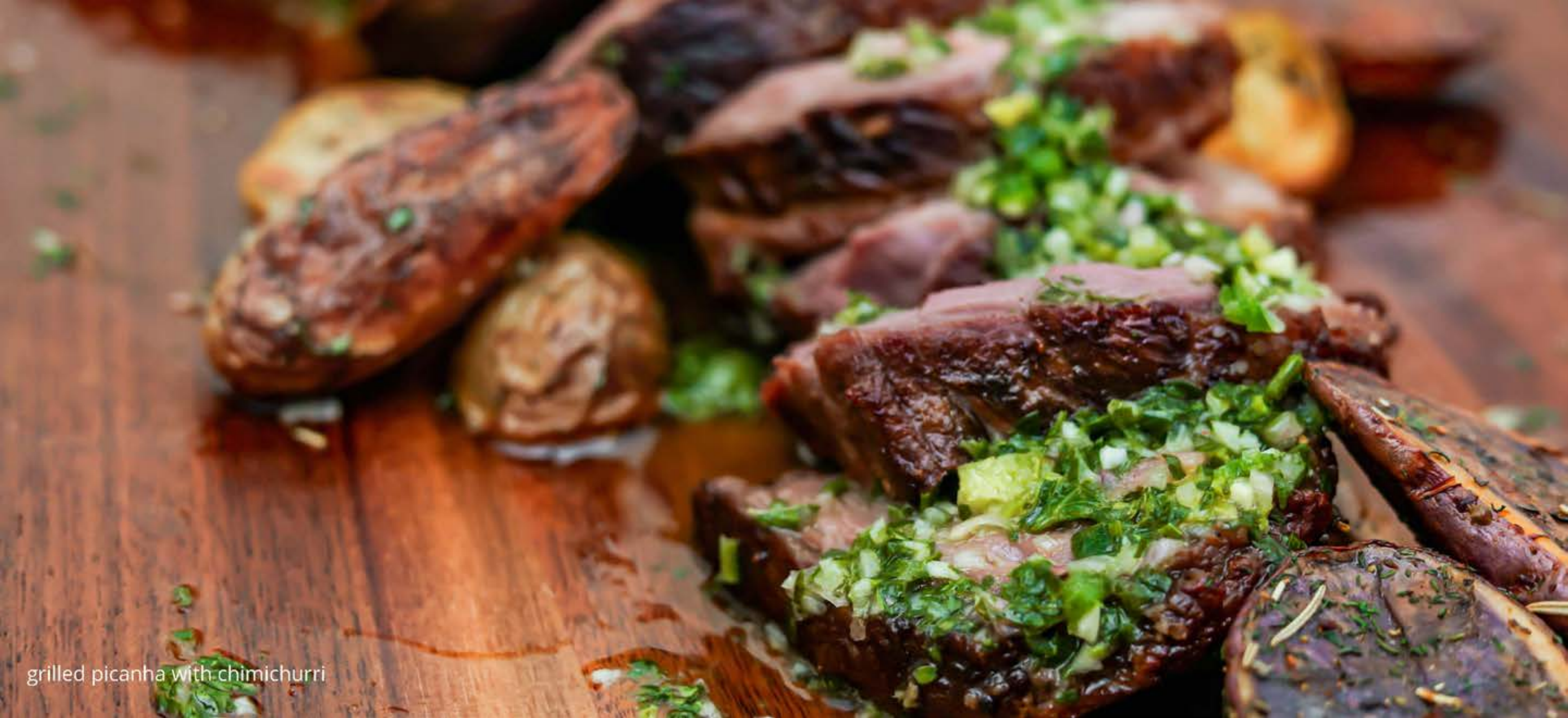
grilled picanha with chimichurri