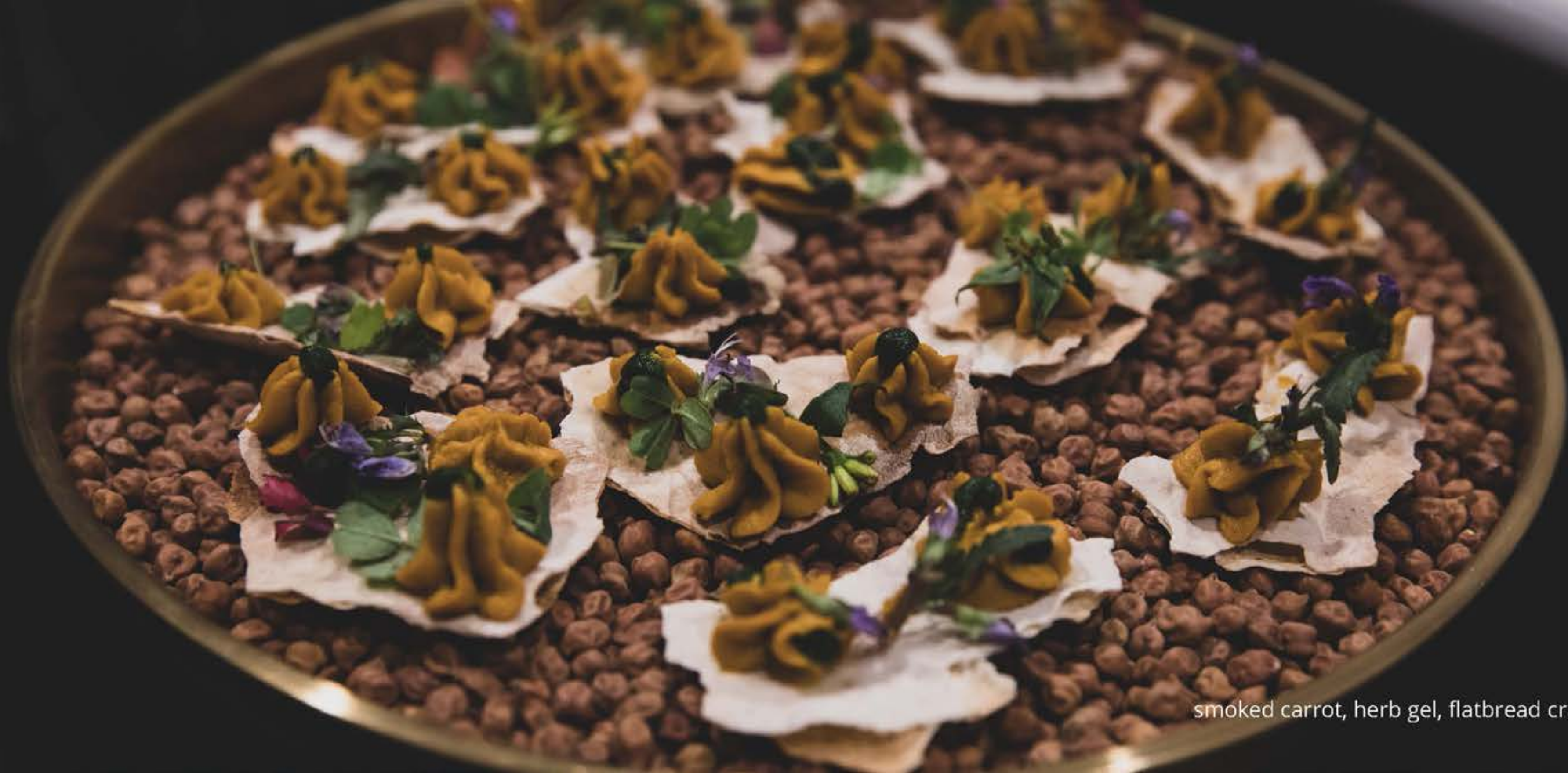
smoked carrot, herb gel, flatbread cracker